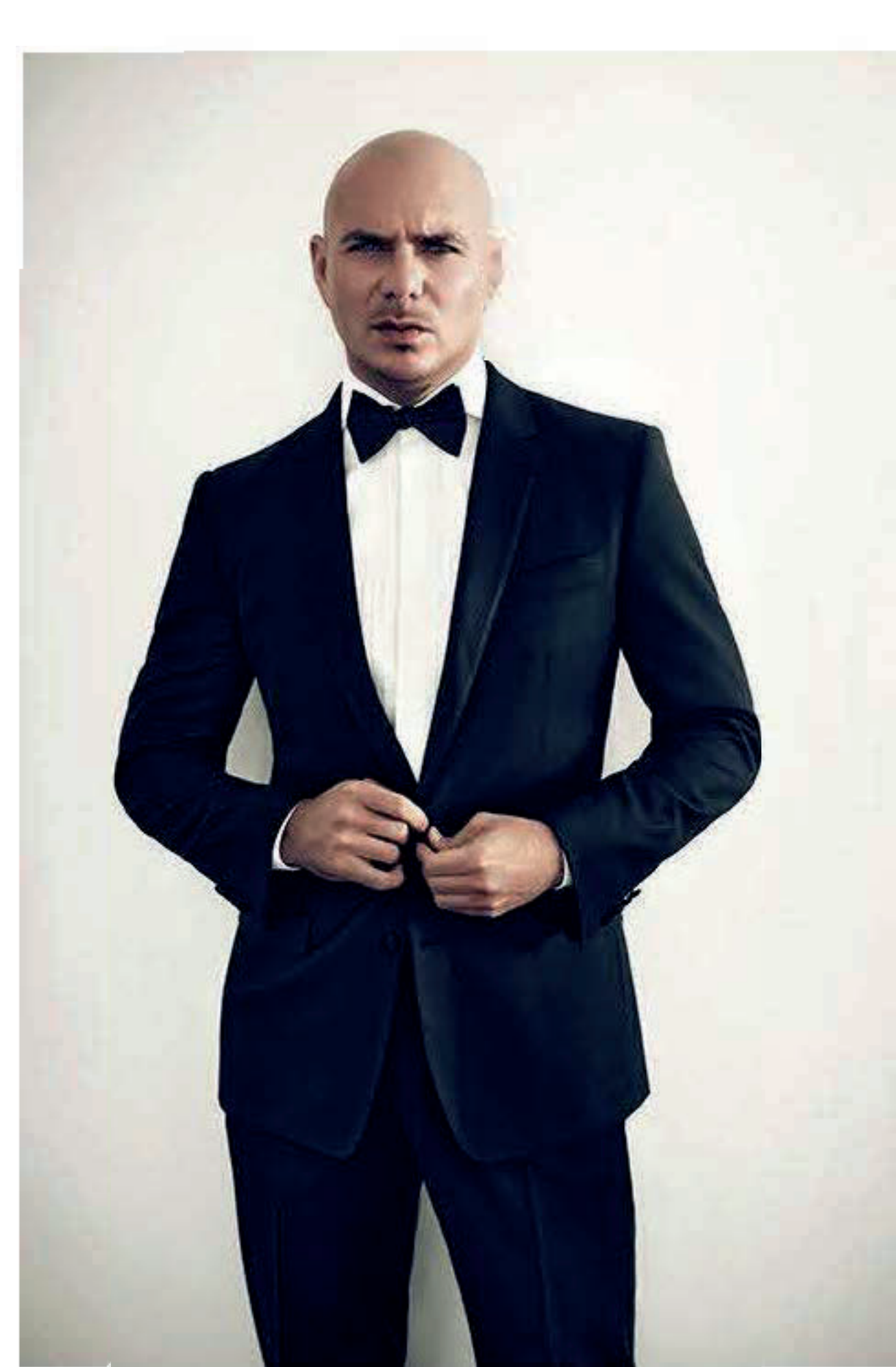
Pitbull to perform at Destination Fashion